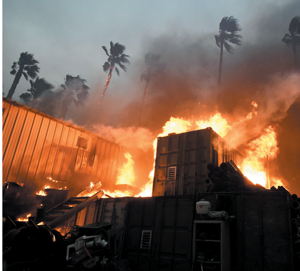
Devastating wildfires ravaged California last month.

A list of co-signatories accompanies this article online (see go.nature.com/2riswcr ).